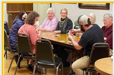
4 Game Night